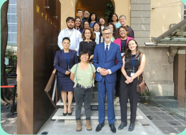
FON-Selected CSOs in Mexico with French Ambassador