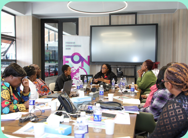
Inception Meeting between Fon CSOs in Kenya with FON team

The incubation program aims to help CSOs adopt an entrepreneurial approach and enhance financial sustainability through a 5-month initiative. CSOs will undergo monthly remote training, receive coaching, and access technical consulting. A 3-day in-person seminar in June in Abidjan, Côte d'Ivoire, will further strengthen their collective power.