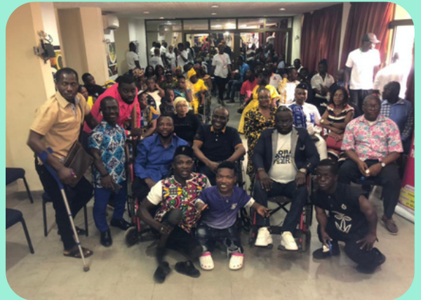
Action et Humanisme Cote d'Ivoire

Funded by FON, this project serves 32 disabled people: 29 women and 3 men in the first phase. They took part in a training workshop on January 9, 2024, at the Maison des Jeunes de Yopougon, on economic empowerment.