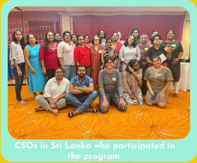
CSOs in Sri Lanka who participated in the program