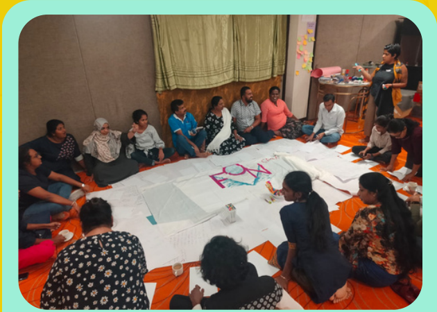
FON-Selected CSOs in Sri Lanka

We look forward to witnessing the transformative impact of these feminist approaches as participants take them forward in their advocacy and project design endeavors.