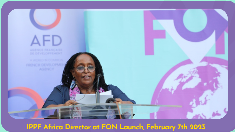
IPPF Africa Director at FON Launch, February 7th 2023

For a world free of Gender-Based Violence